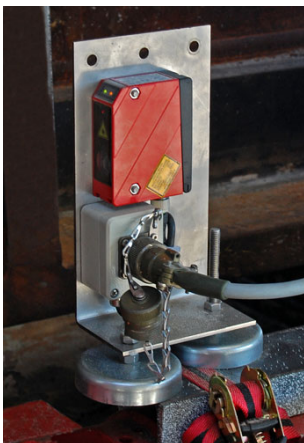
Figure 5. The mounting plate with the sensor is attached and aligned by means of a magnet (Syrinx Industrial Electronics, www.syrinx.nl )