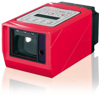
Figure 3. The ODSL 30 laser distance sensor convinces with its integrated display (Leuze electronic)