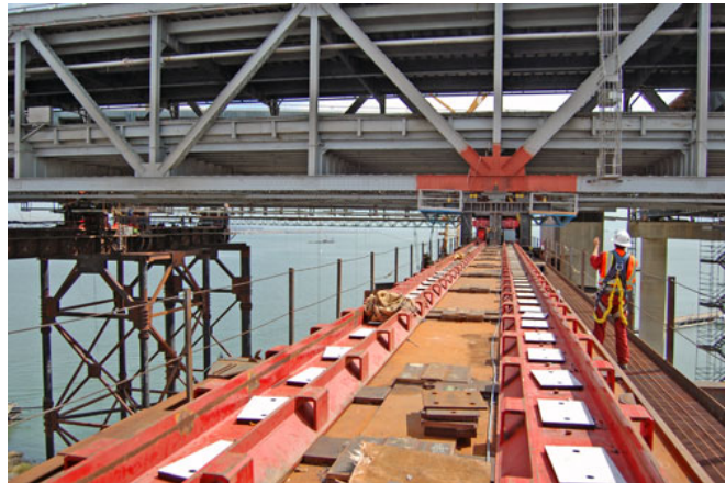
Figure 4. The large operating ranges place special requirements on the application (Syrinx Industrial Electronics, www.syrinx.nl )