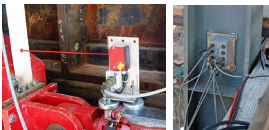
Figure 7. The distances during the bridge movement are measured by the ODSL 96B (Syrinx Industrial Electronics, www.syrinx.nl )