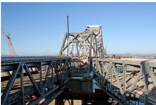
Figure 1. A bridge segment is moved in the final stage of construction